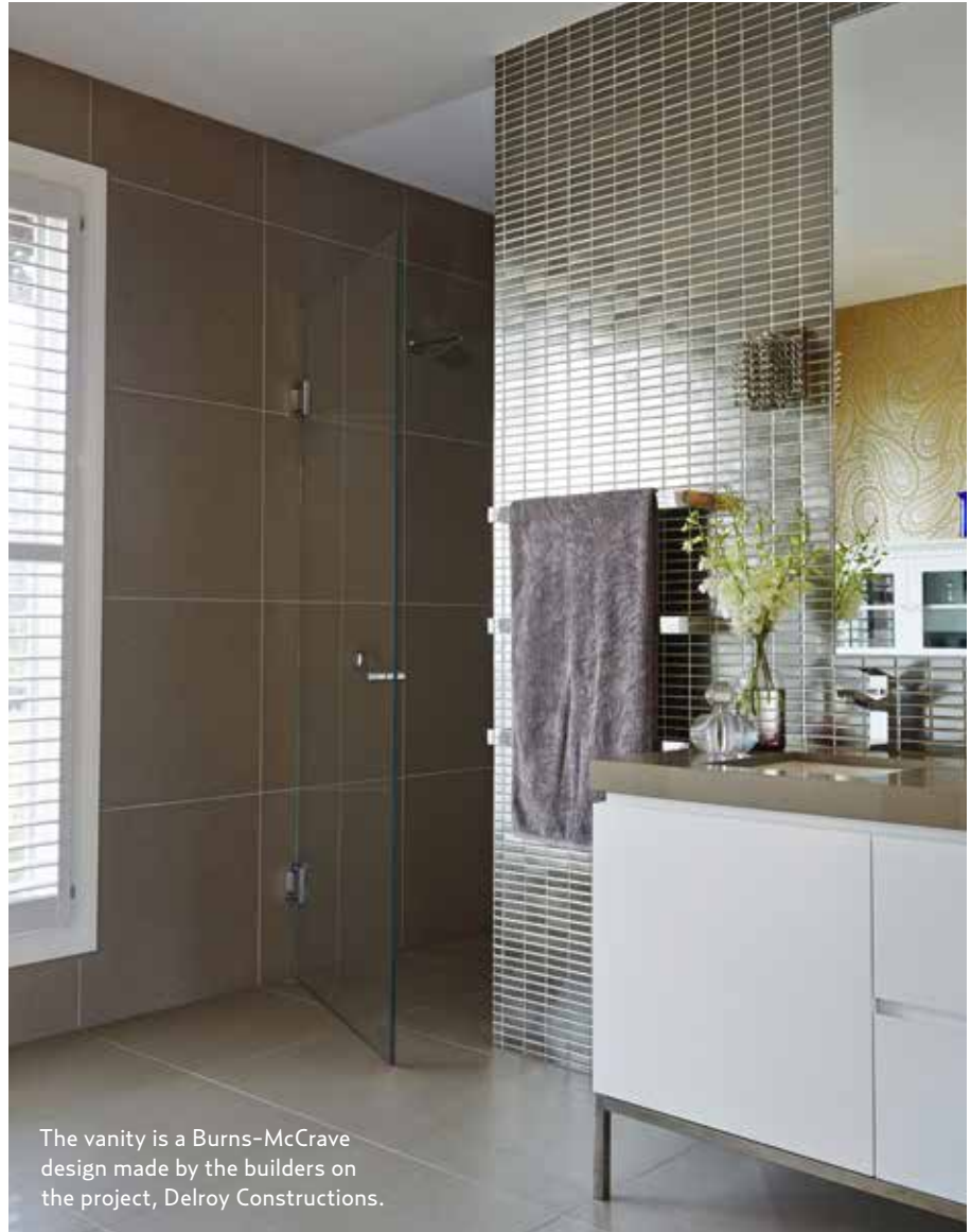
The vanity is a Burns-McCrave design made by the builders on the project, Delroy Constructions.