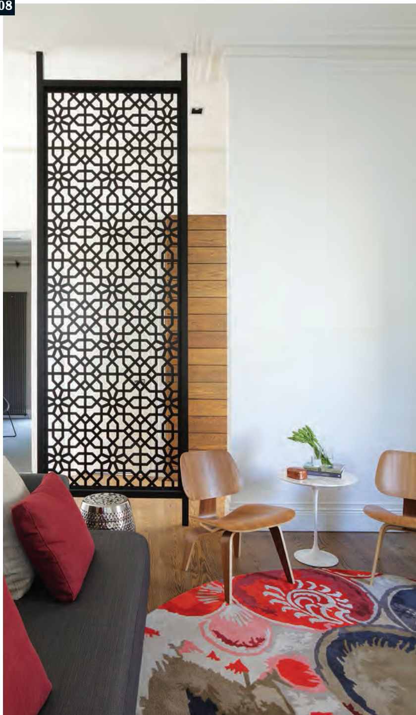
08 A sitting room near the entry provides a welcome retreat for a tête-à-tête.