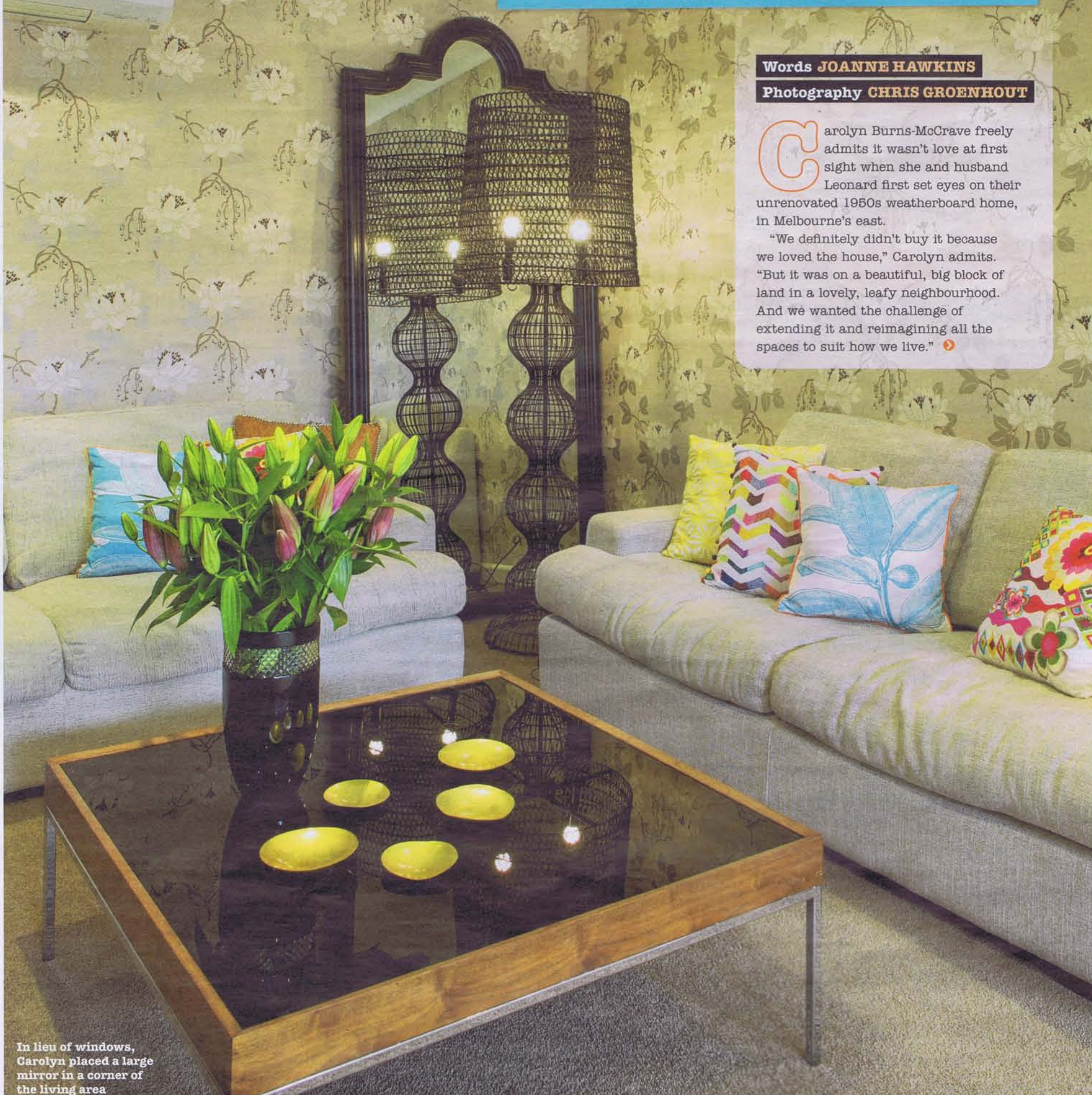
In lieu of windows, Carolyn placed a large mirror in a corner of the living area

bed you espe kitch open flood "I smi you' Or natu inte use