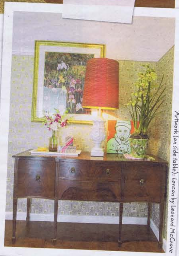
Artwork (on side table): Lorcan by Leonard McCrave