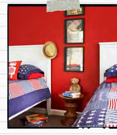
BOYS' BEDROOM Star-spangled bedspreads from Ebay and a red feature wall create a cheerful American theme.